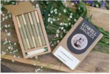
Coming to a store near you