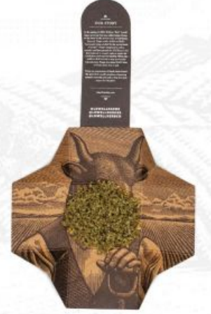
3.5G JAR FLOWER